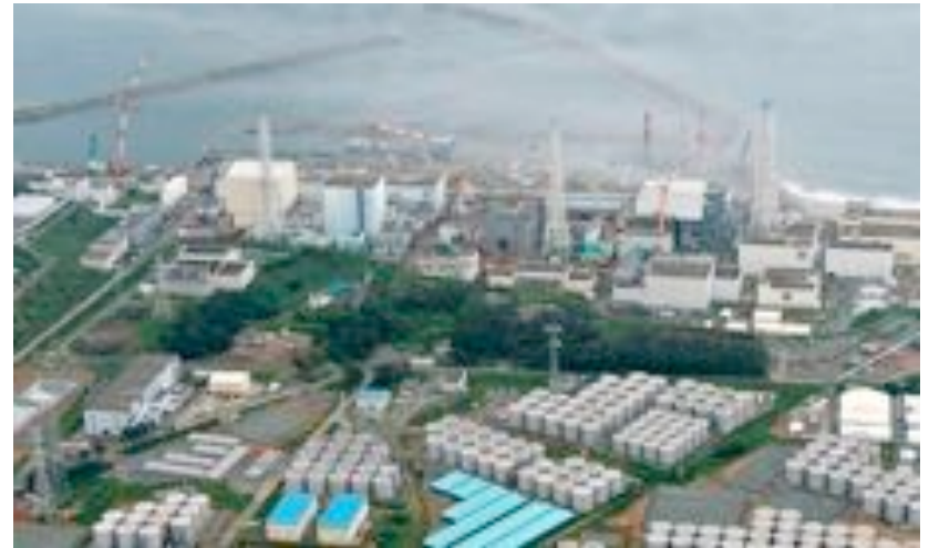
Fukushima Daiichi nuclear power plant, August 2013